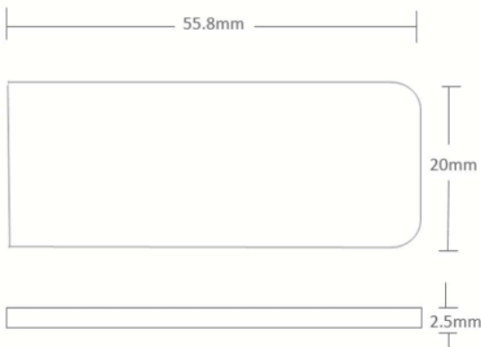
Dimensions stated in mm